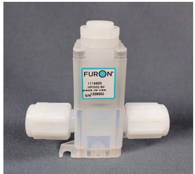
Saint-Gobain's pressure relief valve solution is designed to limit upstream pressure to protect sensitive equipment. Settings are customizable and can be locked into a tamper-proof position.

The HPVM-RV valve offers a simple but reliable solution to limit pressure spikes in the process line based on a pressure relief valve with a great track record in the semiconductor industry, providing the customer a safer system. The combined safety and flexibility offered by its adjust and lock nut system, make it an ideal component for demanding operations experienced today in the wafer processing equipment.